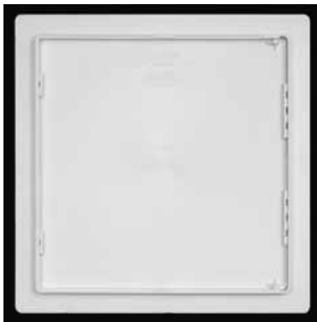
PA-3000 View of door back