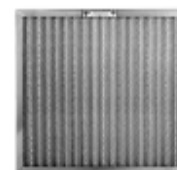
Permanent Foam Filter